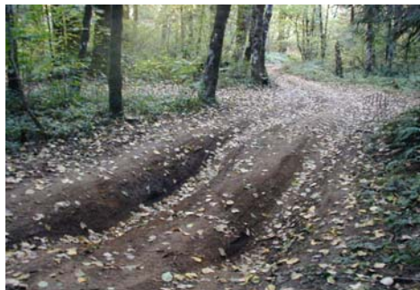
Ruts produced by 4-wheel drive vehicles.