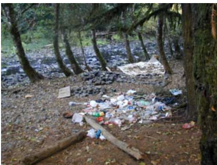
Litter from an abandoned campsite.

The North Yamhill is one of Yamhill County's most beautiful rivers. Come help us clean up an abused area by the wooden bridge on Old Railroad Grade Rd. This clean-up is part of a larger project where erosion control techniques will be used to remedy damage caused by misuse of 4-wheel drive vehicles. Please call the YBC at (503) 472-6403 to register.