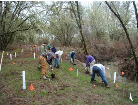
Perrydale FFA students plant trees and shrubs on the banks of Muddy Creek.

Over fifty volunteers, including thirty-six students from the Perrydale High School FFA, eight middle school students from Dayton and five YBC Members helped to plant over five hundred trees, shrubs, and willow cuttings along Muddy Creek at the Riedman Property. See page 2 for details.